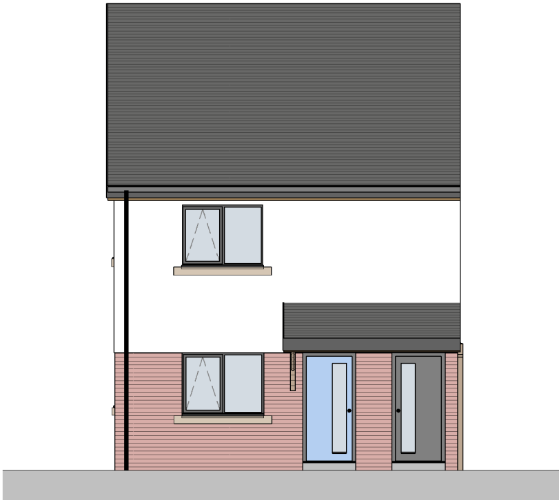
FRONT ELEVATION (HANDED) SCALE: 1 : 100