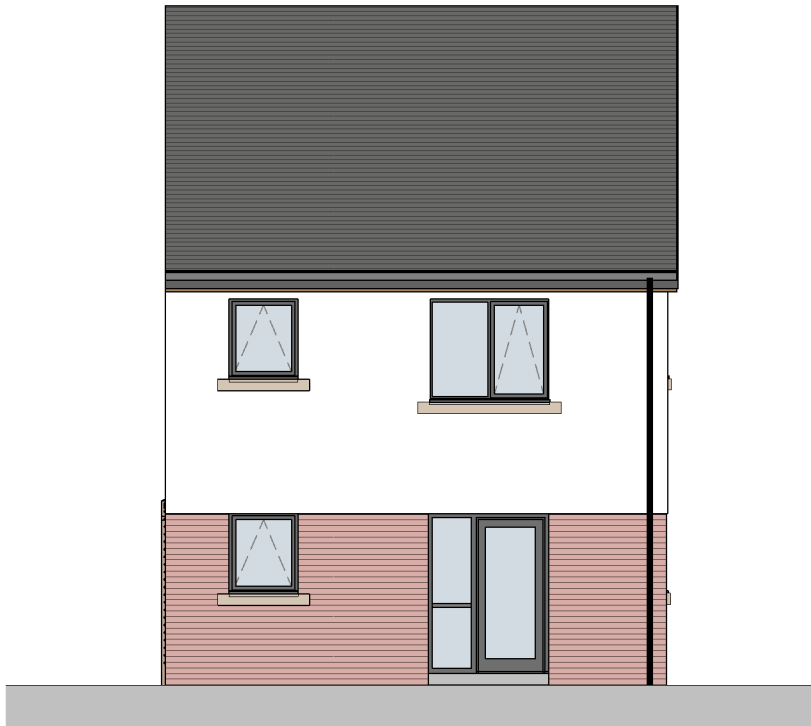
REAR ELEVATION (HANDED) SCALE: 1 : 100