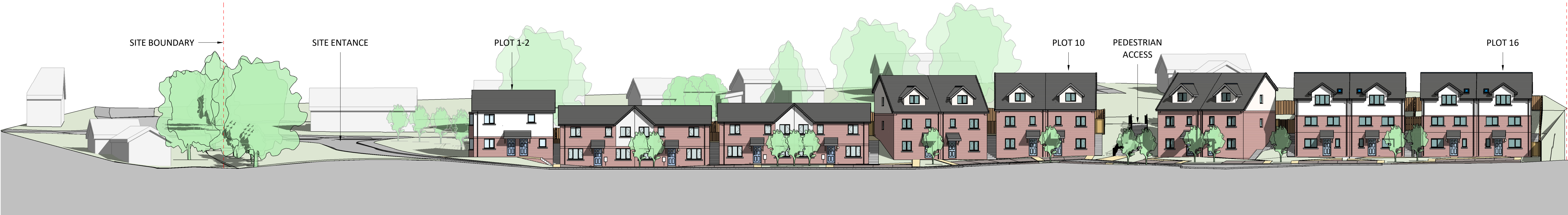
STREETSCENE WITHIN SITE LOOKING SOUTH