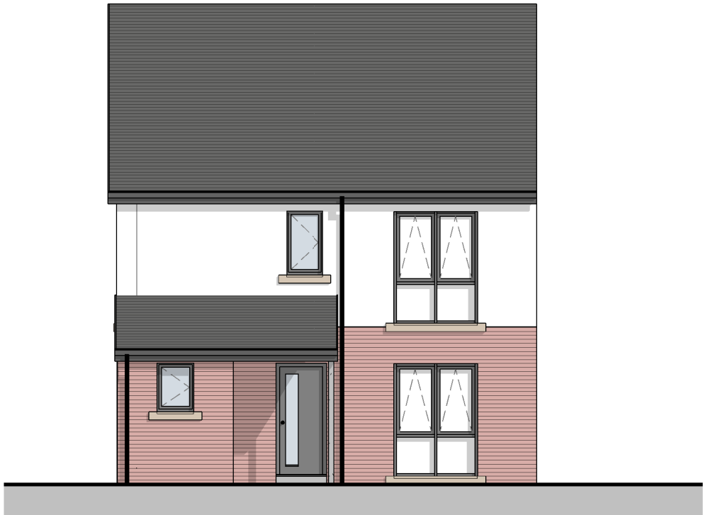
FRONT ELEVATION (HANDED) SCALE: 1 : 100