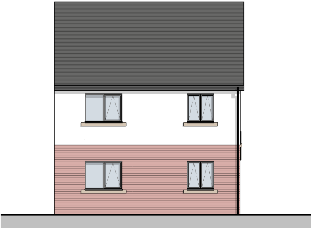
REAR ELEVATION (HANDED) SCALE: 1 : 100